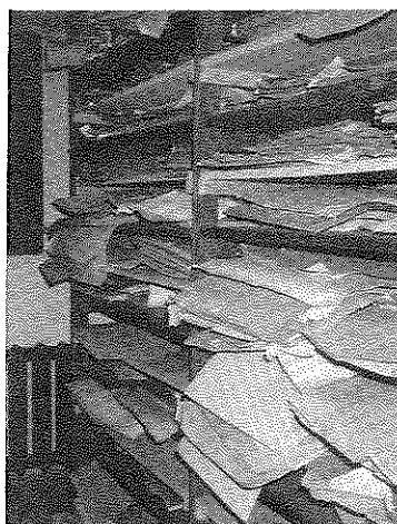
Saints Cyril & Methodius National Library, Sofia. Early printed Bulgarian imprints.

Although originally associated with monasteries, by the ninth century libraries were the center for culture and learning; by the tenth they conveyed this culture to Russia. Then, during the Ottoman occupation from 1393 to 1896, many of the monasteries closed. Monks taking refuge in the neighboring countries of Serbia, Wallachia, Moldavia, and the Ukraine took with them not only manuscripts, but also literary and scholarly traditions. In the later years of the Ottoman occupation, around 1839, libraries known as reading rooms opened in remote villages.