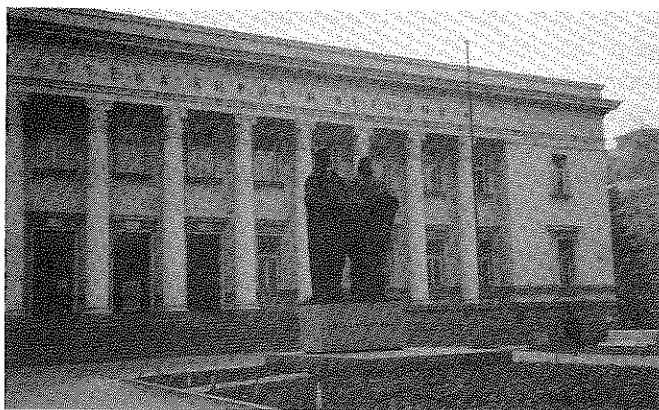
Saints Cyril & Methodius National Library, 1994.

Sofia is the present day capital of Bulgaria and home to its most extensive library collections. The Saints Cyril & Methodius National Library, founded as an open public library in 1878, is the only national library for the Republic of Bulgaria. The Publications Depository Act of 1897 ensures that the library receives, on legal deposit, all Bulgarian books and periodicals. In 1953, the library moved into its current building, which is now overwhelmed by 6.6 million volumes representing materials from the eleventh century to the present. The library employs 300 persons who in 1993 provided service to 25,000 readers with 872,594 items circulating. All materials circulate except for rare books, manuscripts, periodicals, and restored materials.