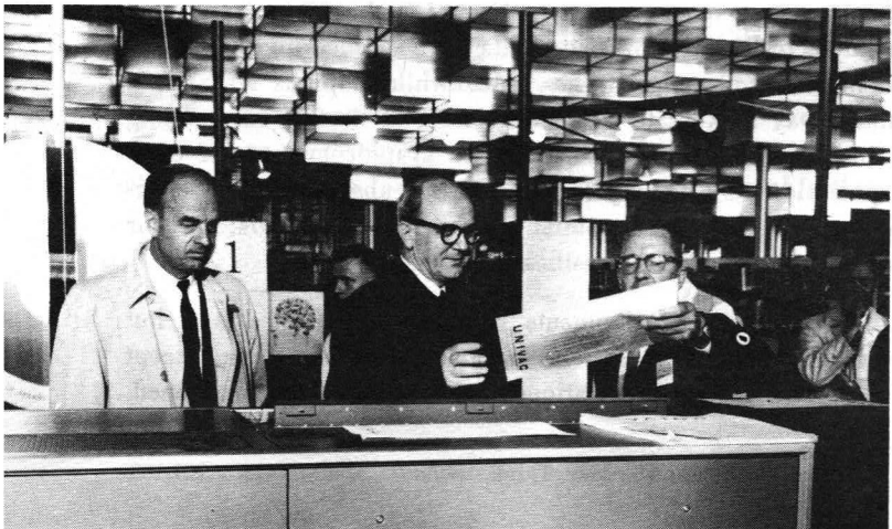
Below: Secretary of State Dean Rusk, center, examines answers to a choice of questions printed out by an information storage and retrieval system featured by a solid-state computer.

the service provided by the new mechanisms cannot yet compete either in cost or convenience with the traditional methods; for the purposes which most libraries serve, the book still provides the least expensive and most convenient form of storage of information, and the card catalog and the book-index the most flexible and effective instruments for reaching it. For another, even were techniques and devices developed which would enable a mechanized service to rival or even to exceed the satisfactoriness of traditional methods, the new mechanisms would require an expensive conversion of records to machine-readable form—typically microtext, punched cards or computer tape. It may be foreseen that records will eventually be initially published in such forms (and indeed, there are harbingers of this); but, meanwhile, libraries will necessarily be slow to convert.